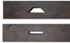
Custom Dies Available